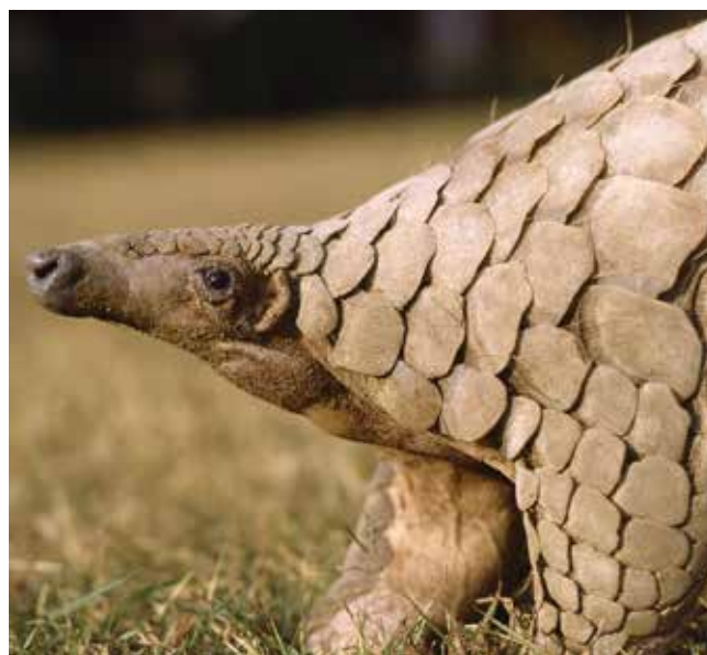
▲ Image 26: An Indian pangolin scales showing hairs between scales.