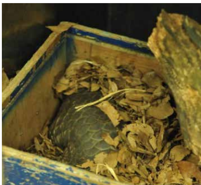
▲ Image 7: Wooden holding container with leaf litter for a Chinese pangolin to dig in and bury itself.

Do not use an organic substrate (leaf litter, soil, straw) if the pangolin has any open wounds.