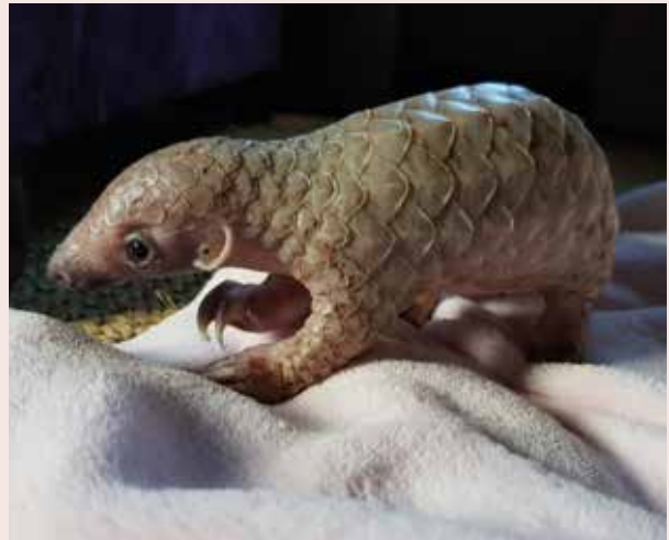
▲ Image 16: Infant pangolin, approximately 10 days old, with semi-transparent scales