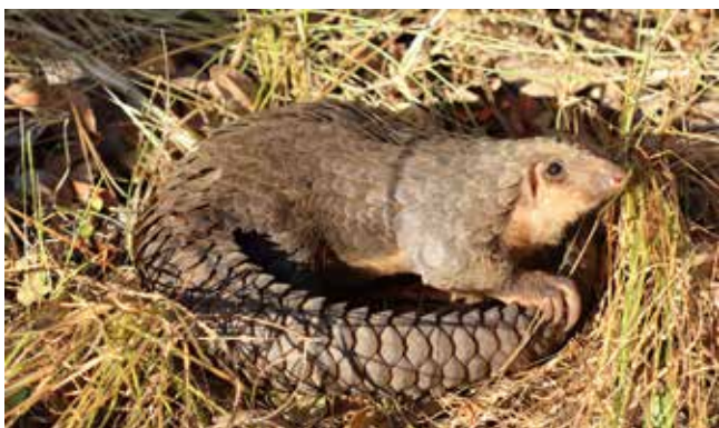
White-bellied pangolin ( Phataginus tricuspis ) 15