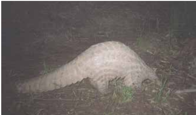
Giant pangolin ( Smutsia gigantea ) 13