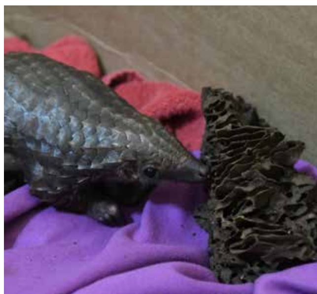
▲ Image 23: Juvenile white-bellied pangolin feeding from an ant nest.

To do this, always walk within two metres of the pangolin. If it is dark outside, bring a torch to illuminate the pangolin and its surroundings. Often a pangolin's natural response when being walked will be to hide in small spaces. Be aware of any holes, burrows or crevices between tree roots in the vicinity, as the pangolin, if healthy, may try to escape into these and will be difficult to recapture.