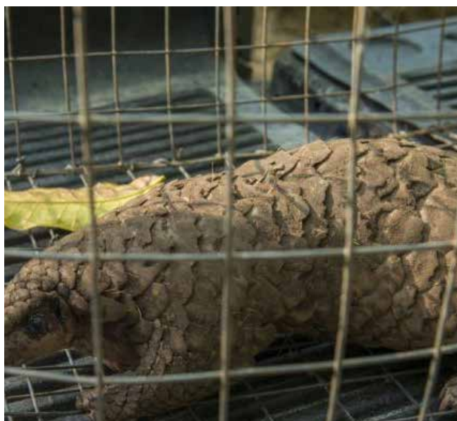
▲ Image 11: Sunda pangolin found in a wire cage in Sabah, Malaysia.

3. Once the container is open ( Image 12 ), immediately remove the pangolin, using both hands to pick it up. See Box 2 for more instructions on handling the pangolin.