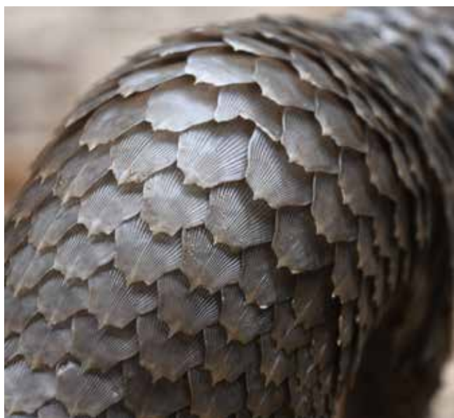
▲ Image 25: A white-bellied pangolin's scales with no hairs between scales.