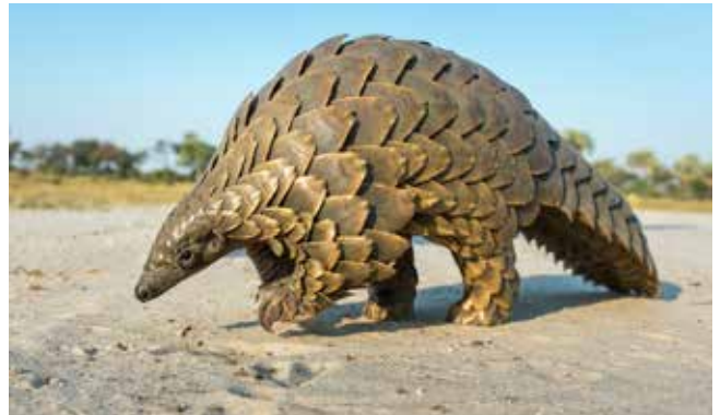
Temminck's pangolin ( Smutsia temminckii ) 14