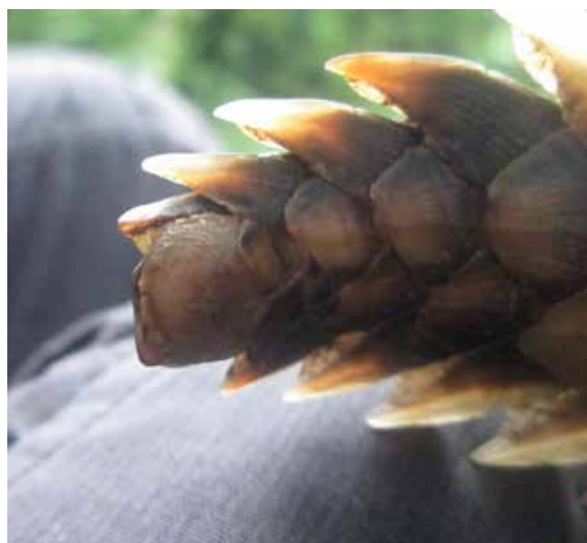
▲ Image 28: Close-up of the underside of a black-bellied pangolin's tail with pad at the tip of the tail.