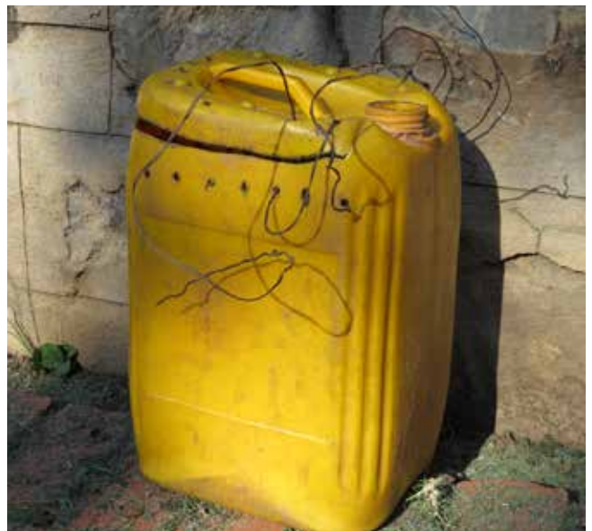
▲ Image 10: Plastic drum sewn shut with wire.

Furthermore, whilst rare, there have been instances in African countries where pangolins have been found with holes drilled in their scales and wire threaded through them, so they are unable to uncurl ( see Image 14 ). Cut the wire using wire cutters and very carefully remove it. If you do not have the correct tools available, wait for emergency care to arrive to avoid harming the pangolin whilst attempting to remove the wire.