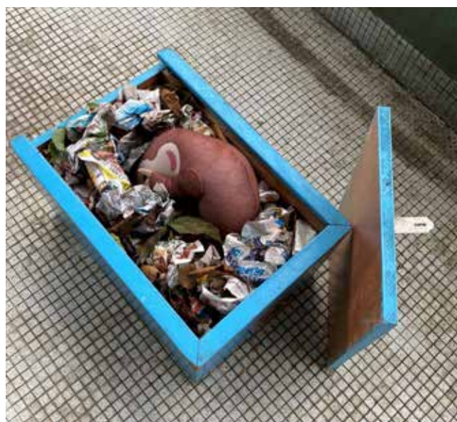
▲ Image 8: Wooden holding container with balls of newspaper for pangolins to roll and bury themselves in. Toy is used for demonstration.