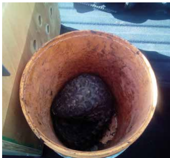
▲ Image 12: Temminck's pangolin found in plastic bucket.

4. Cut away any restrictions binding the pangolin, such as wire or netting, using scissors or wire cutters, being careful not to hurt the pangolin ( Image 13 ).