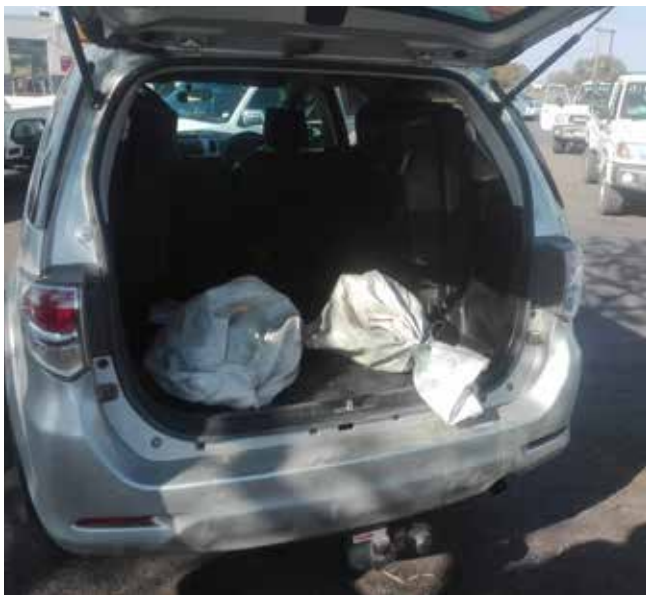
▲ Image 1: Trafficked pangolins are often found in tied up sacks in the backs of cars.

This section provides instructions on how to create a holding container. Key considerations include using material that the pangolin cannot break through, using a suitable substrate that the pangolin can hide and burrow in, and creating a structure that has air holes or vents and a solid lid. The pangolin can be held in this holding container for 1-2 days. However, it should be checked at least every 4 hours, given the opportunity to exercise if it appears to be in distress and be provided with water. Ideally, the holding container will be easily portable so the pangolin can be transported in it to a suitable care facility for longer-term care.