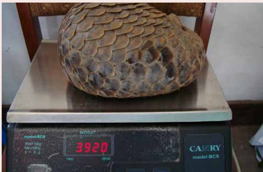
▲ Image 24: Chinese pangolin weighed on digital scale.

Record the pangolin's weight on the day of confiscation and subsequent days and compare the weight of the pangolin to the first weight recorded. If the pangolin's weight remains stable or increases, the pangolin's health is likely to be stable. If the pangolin's weight is decreasing, its health is likely deteriorating.