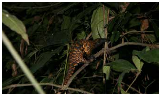
Black-bellied pangolin ( Phataginus tetradactyla ) 16

Distinguishing features: 1. White skin on belly (lighter than scales), 2. Scales have three distinct points at end, 3. Long tail – 1.5 times length of head and body, 4. No hairs between scales, 5. Pad at end of tail.