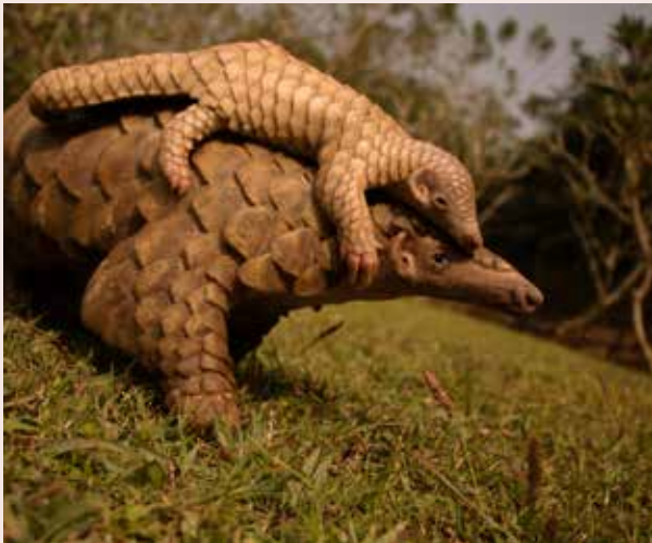
▲ Image 15: Infant Indian pangolin being carried on its mother's back.