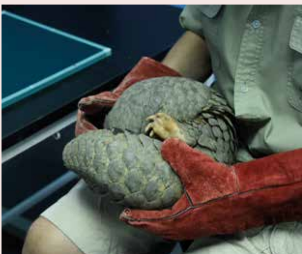
▲ Image 19: Curled up pangolin being carried using safe handling method.

Before moving the pangolin, ensure the place it is being transferred to (e.g. on the ground, in its holding container or on another surface) is safe. To do this, block any escape routes, remove any objects the pangolin might tightly curl up around, and ensure the surface is stable and away from any hazards (e.g. sharp objects, significant heights the pangolin might fall from).