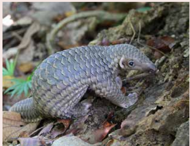
▲ Image 18: Juvenile Sunda pangolin; its scales have hardened.