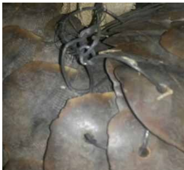
▲ Image 14: Wire threaded through a Temminck's pangolin's scales.