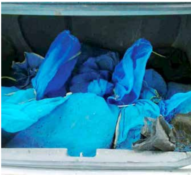
▲ Image 9: Pangolins confiscated in Malaysia in black and blue plastic sacks.