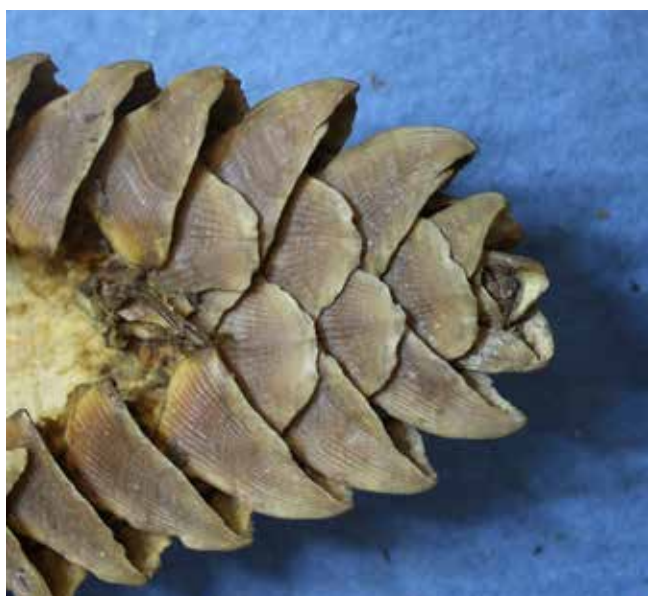
▲ Image 27: Close-up of the underside of a Temminck's pangolin tail with no tail pad at the tip of the tail.