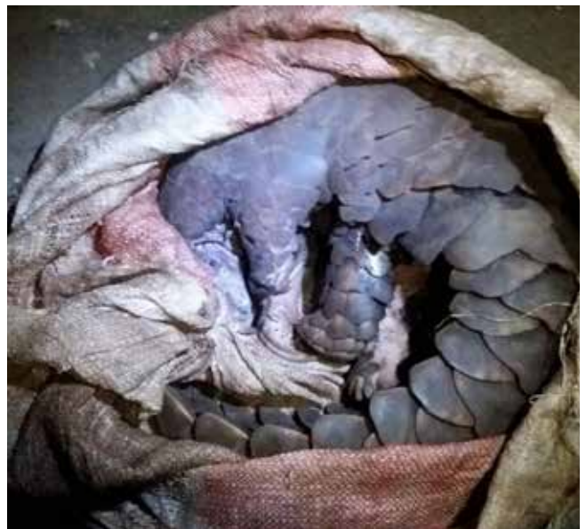
▲ Image 2: Pangolins trafficked in Africa and Asia are frequently constrained in nylon sacks.

If it is not possible to create individual holding containers for each pangolin, then temporarily housing more than one pangolin together is acceptable until a more suitable space can be found. However, the holding container should ideally be large enough so that both pangolins can stretch out and access water. See below for more information on creating a holding container.