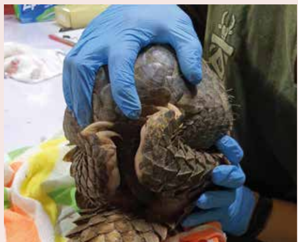
▲ Image 20: Partially curled up pangolin being carried using safe handling method.