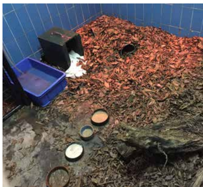
▲ Image 22: Typical safe space for longer-term captivity of pangolins.

Image 22 shows an example of a safe space for pangolins kept in longer-term care prior to release back into the wild. It is recognised that it may not be possible for the first responder to deliver this standard of care, but the safe space should aim to replicate this example, using the available resources.