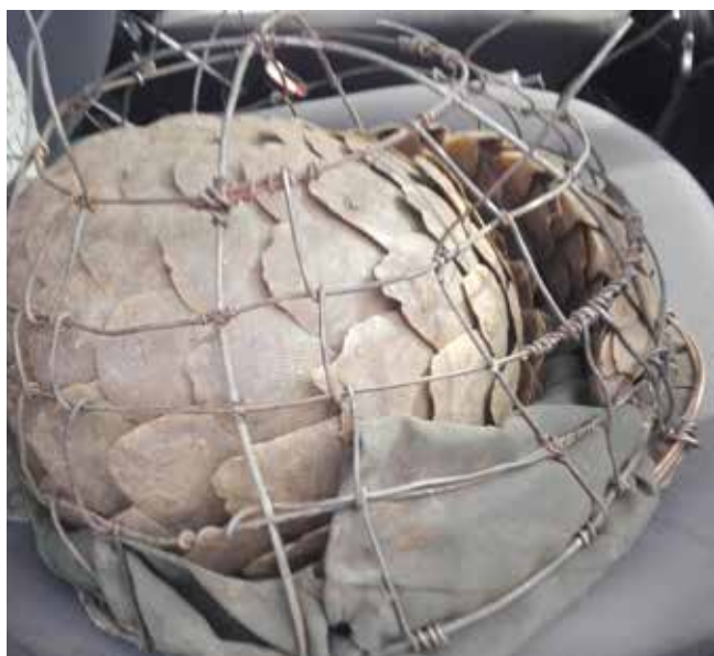
▲ Image 13: Temminck's pangolin confiscated in makeshift wire cage.