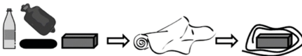
▼ Figure 1. Instructions for creating a heat source for the pangolin

If the safe space is particularly cold to a pangolin (i.e., less than 18°C/64°F), place an additional towel or blanket in the pangolin's holding container. If the space is particularly warm (more than 30°C/86°F), place the heat source further away from the pangolin, or provide extra ventilation such as a fan.