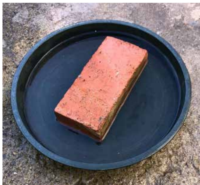
▲ Image 21: Water bowl weighed down by brick to prevent it from tipping over.

If the holding container is not large enough to contain the water bowl, place it just outside of the container and allow the pangolin regular access. Provide the pangolin with access to the water every 3-4 hours. The water should be replenished at this stage as well – see below for more information on checking on the pangolin.