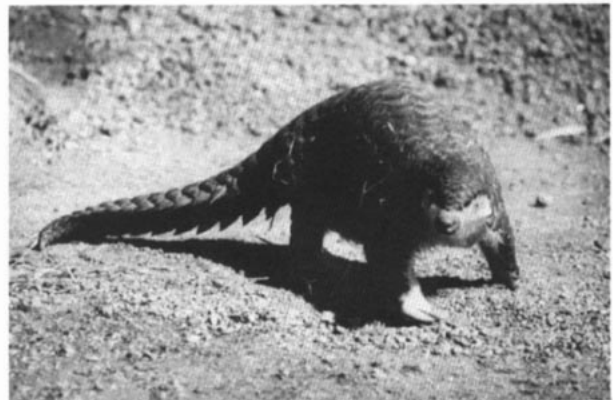
FIG. 1. Adult male pangolin from China.