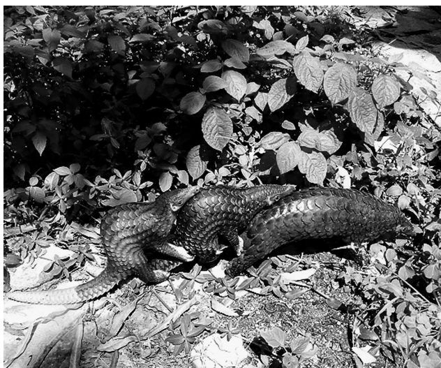
Fig. 2. This picture shows two young riding on the tail of a female Sunda pangolin – suggesting it gave birth to twins.

for mating. At irregular intervals, their sexual responses were observed and when it was suspected mating had occurred the female was housed individually.