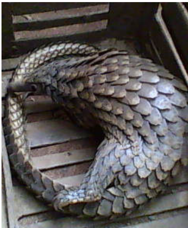
Figure 3 Live pangolin on display.

golin scales called "Nagi" is utilised. Also the Tibet energising "Lungta" utilised the scales of pangolin [31].